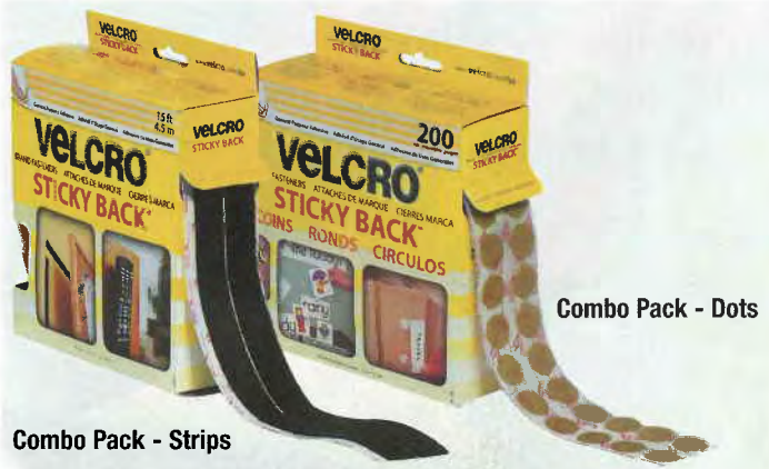
Combo Pack - Strips