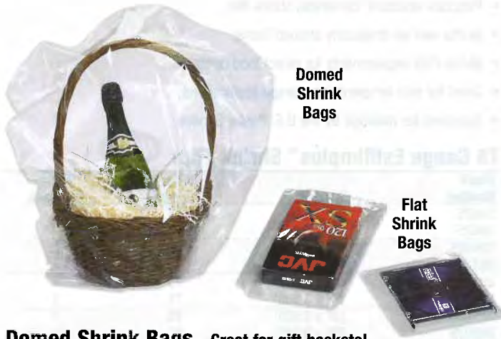
Domed Shrink Bags